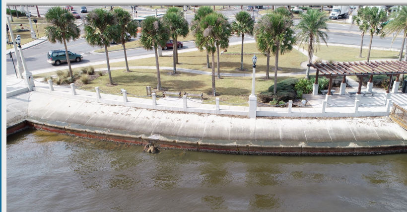
North Gibbs Park