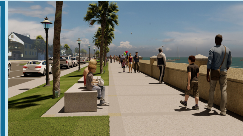
Sidewalk View Looking North