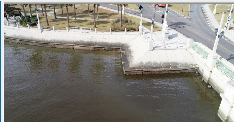
South Gibbs Park