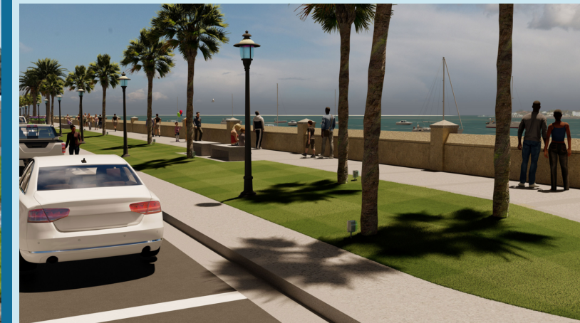
Street View Looking Northeast along the Seawall