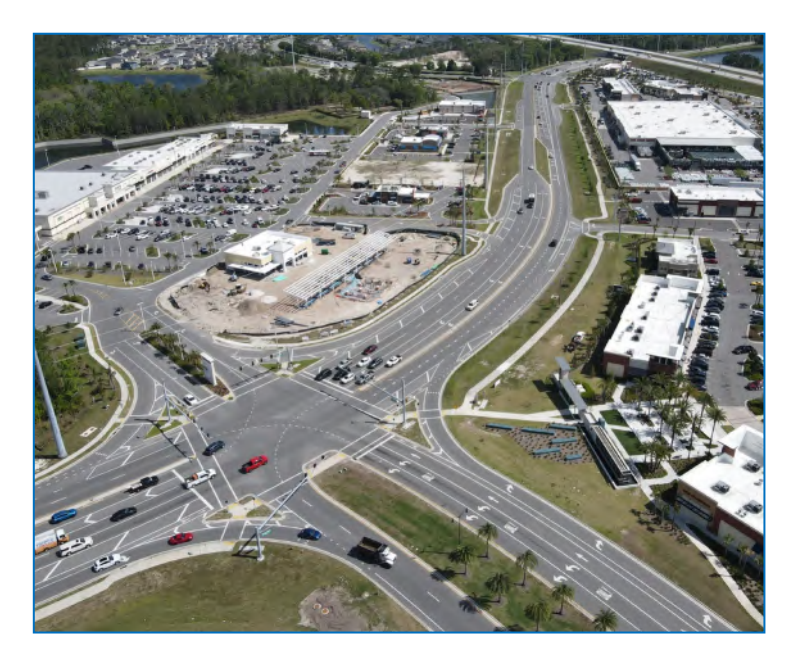
Access management provides access to adjacent homes and business. It does not impact the demand for goods and services