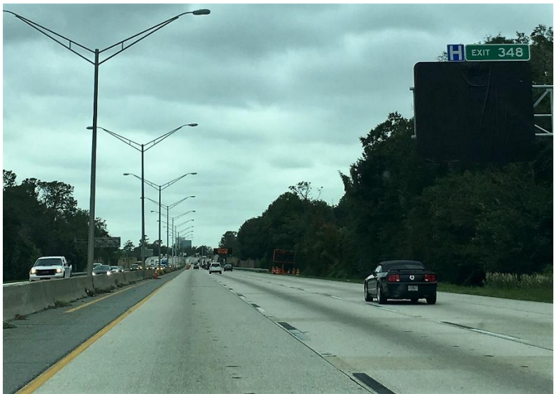
I-95 NB approaching decision point area before San Diego Road overpass.