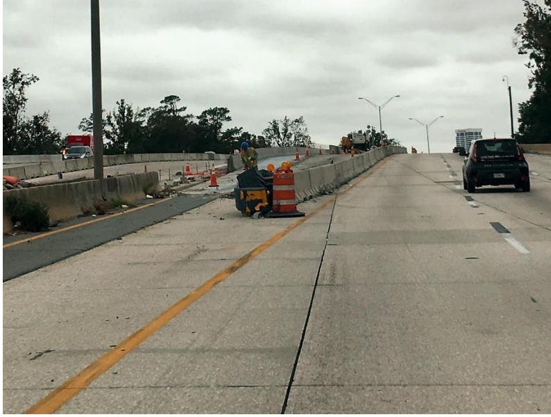
I-95 NB decision point area approaching the San Diego Road overpass.