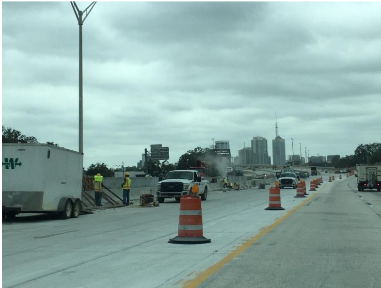
New I-95 NB lanes on left being finalized for traffic shift. Service lanes to downtown are on right.