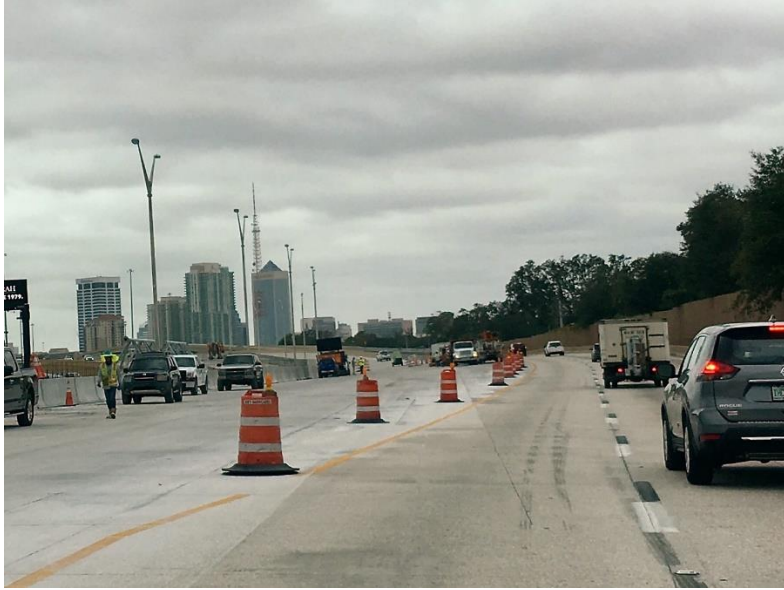
New I-95 NB lanes on left being prepared for traffic shift; downtown lanes ONLY are on right.